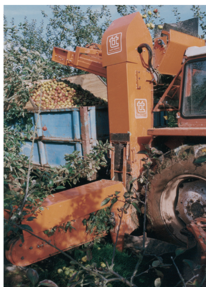
Centipede harvester in 5.5 metre row

This versatile pedestrian self propelled harvester is very popular in both standard and bush orchards. Output is over 1 tonne per hour, the pickup width is 800 mm. The harvester uses a hedgehog cleaning belt to give a good fruit sample. The harvester is powered by a Honda 5.5 HP air cooled engine and has a 5 speed transmission. Price £5,200 + VAT (available ex stock).