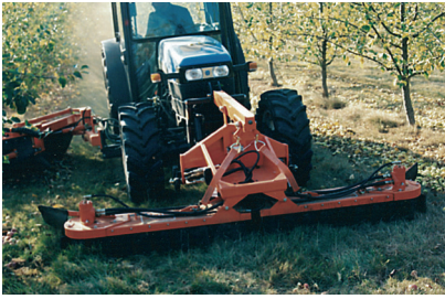
Front brushes and Side sweep coming back up the row