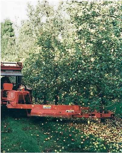
Fast versatile shaker that is at home in any orchard

These front brushes move fruit lying in front of the tractor and clear a path up to 2600 mm (8ft 6") wide giving a good clearance for large trailers. Tractor turning at the end of the row is easy because the Centipede brushes fold as they lift out of work. They fit directly onto a standard tractor three point linkage. Price £5,850 + VAT (available at short notice). If your tractor does not have a front three point linkage an auto-lifting version is available for £6,750 + VAT .