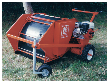
M2000 – versatile and easy to use

I am writing with details of our current range of harvesters, tree shakers and apple brushes. If you would like to see any of them working please call and I will arrange a demonstration for you. At present we have stock of some of our popular machines - others are only built to order.