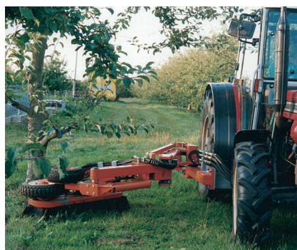
The Centipede Side – easy to position it just where you want